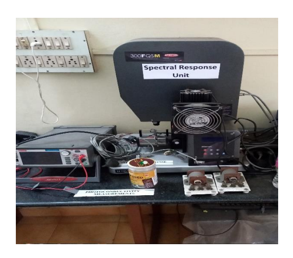
Spectral response unit