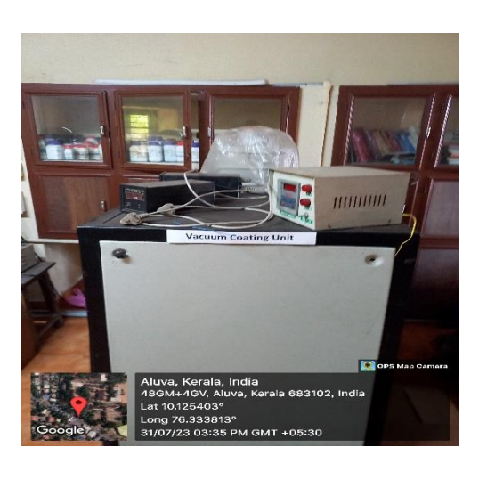
Vacuum coating unit