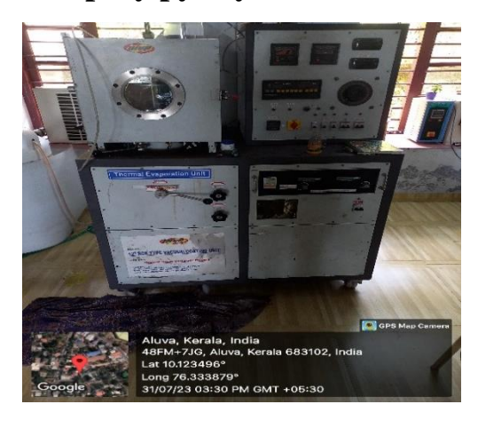
Thermal evaporation unit