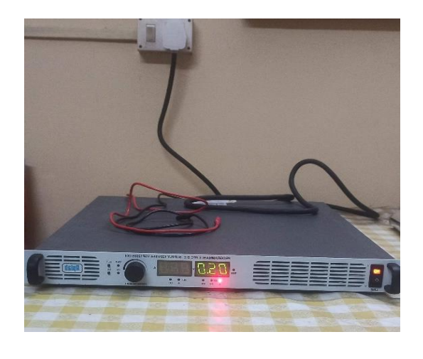
Programable power supply