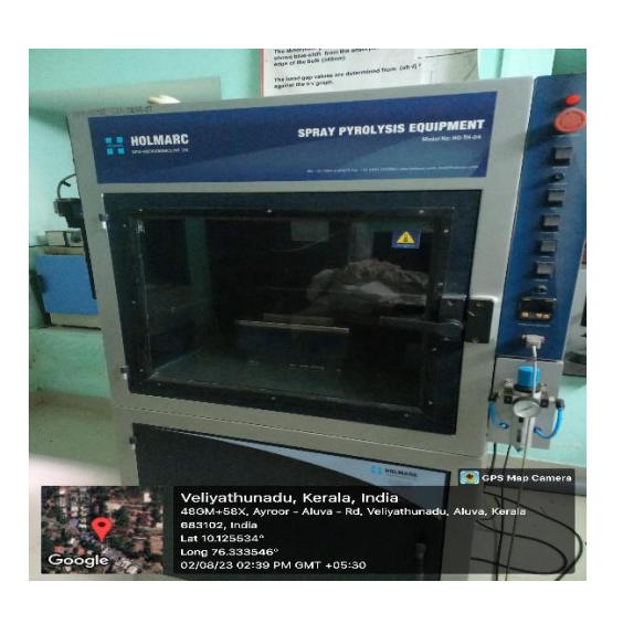
Spray pyrolysis unit