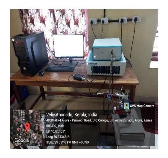
Electrochemical work station