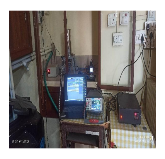
Gas sensing unit