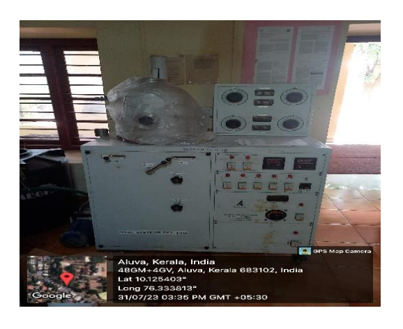
Multi source vacuum coating unit